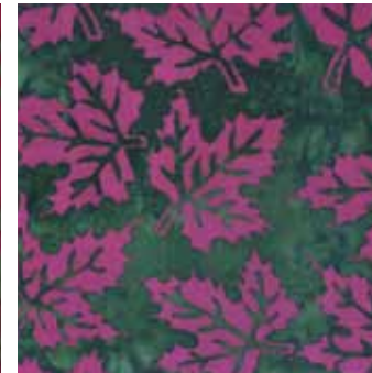
MU-3 -7035 Hot Tango