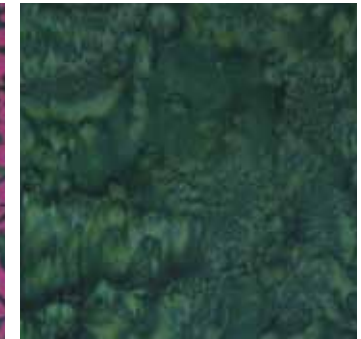
MU-10 -7035 Polos Hot Tango