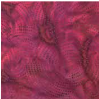
HF-1 -3021 Red Bud