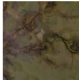
HF-11-3021 Polos Red Blue