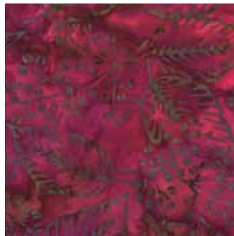
HF-3 -3021 Red Blue