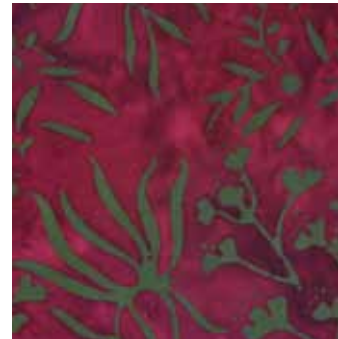
MU-2 -7034 Grand Fuchsia