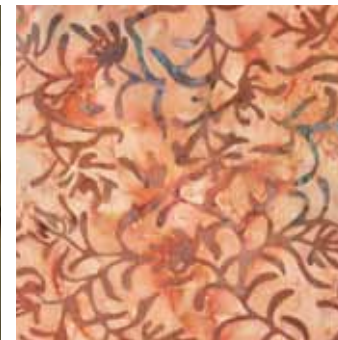
MY-1-6018 Honey Mustard